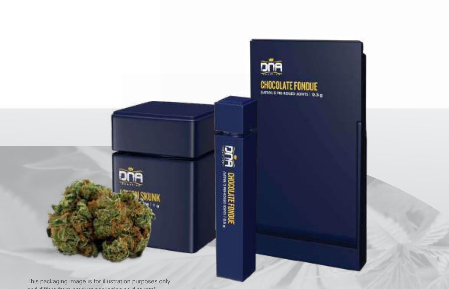
This packaging image is for illustration purposes only and differs from product packaging sold at retail.